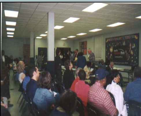
Town hall meeting for Cover the Uninsured Week, March 10,2003.