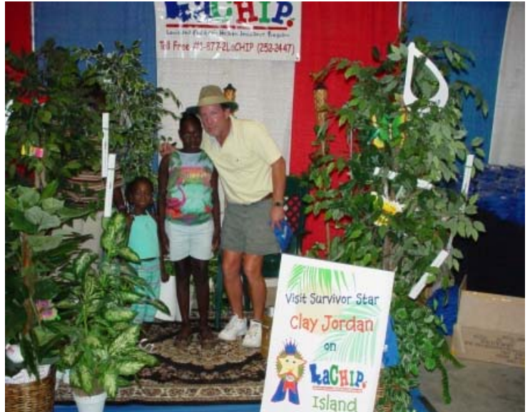
Annual Children's Resources & Health Fair in Monroe this fall featured an innovative way to draw in potentially eligible families using a celebrity photo -op.